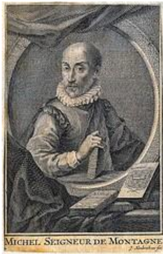
Figure 1: Michel Montaigne's Nonstop Revision